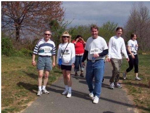
Are we almost done yet?

The team walked a combined total of 25 miles on Sunday and