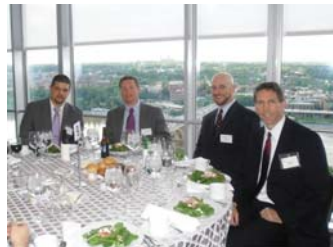
More Table 9