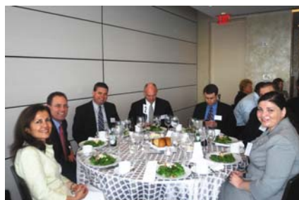
Table 2 - Deloitte