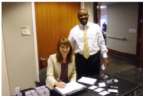
How was YOUR Training?

Most of the slide presentations will be posted to our Web site.