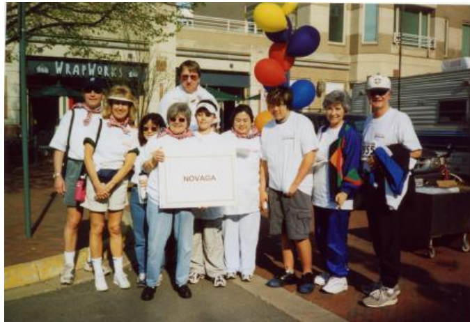
The April 2004 NOVAGA Walk MS Team

Register now at MSandYOU.org/walk . Click on Register on the left side of the page. Click on Register as a Team Member . Click on the Search for a Team button – there are lots of teams already registered – scroll down & select NOVAGA . Click on NOVAGA to see our team page, including a picture from a past year's walk. From there you can click on Join Team where you will be able to join & create your own personal web page. Or you can simply select the name of one of the team members and support us directly in our goals if you can't walk yourself. Donating online is fast, easy, and secure!