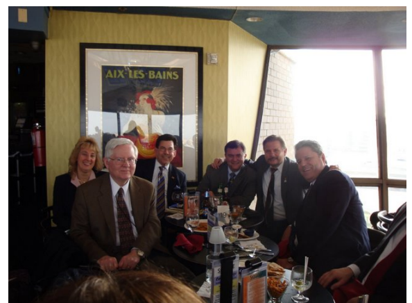
Everyone Relaxes after the Training Event