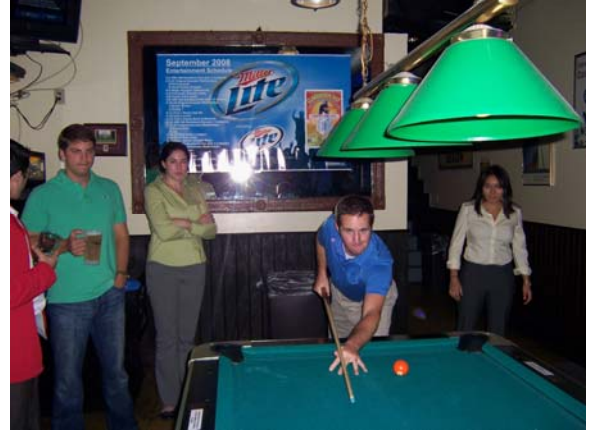
Rackin' 'em up and knockin' 'em down at Whitlows's