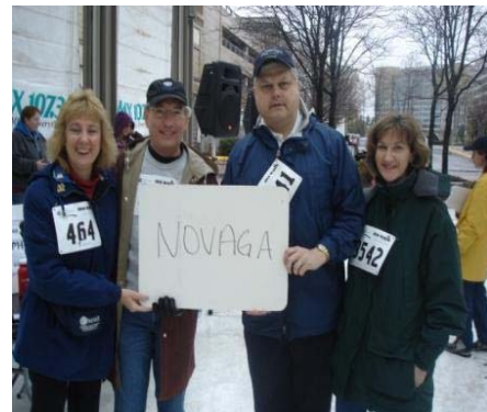
Part of last year's NOVAGA Team

If you have any questions, please contact me at the79rose@yahoo.com or contact the National Capital Chapter of the National Multiple Sclerosis Society at (202) 296-5363 or WalkMS@MSandYOU.org .