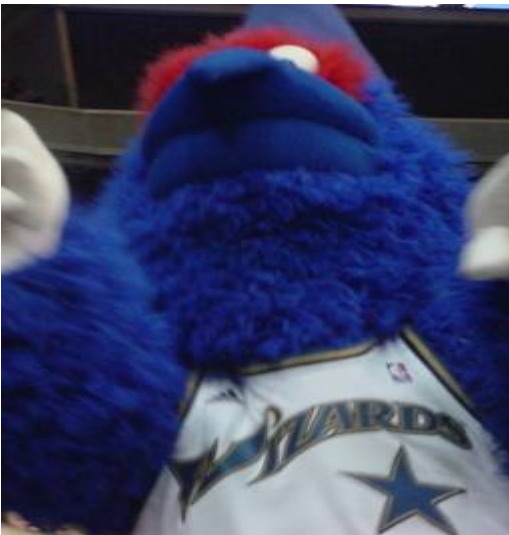
G-wiz stopped by to say hi