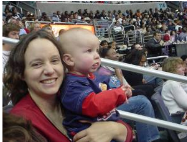
Early Careers seems to be attracting quite the young crowd these days!!