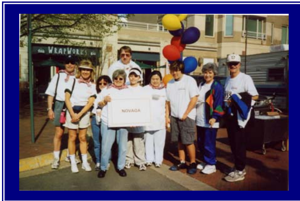
2004 NOVAGA MS Walk Team

**Potomac, MD and Washington, DC are not fully paved walkways and may present challenges to individuals using strollers or durable medical equipment. Accommodations will be made to support all individuals interested in participating at these locations.