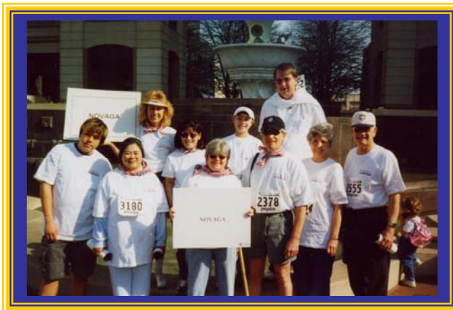
2004 NOVAGA MS Walk Team

So what are you waiting for? With all these options, Sign up today and help to one day find a cure!